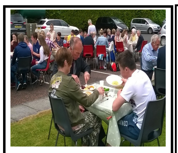
Bannside members enjoying the Church BBQ in June.